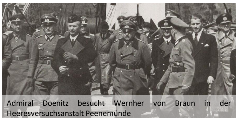
Admiral Doenitz besucht Wernher von Braun in der Heeresversuchsanstalt Peenemünde

All this raises questions about the practice of science in and for a state that commits crimes against humanity.